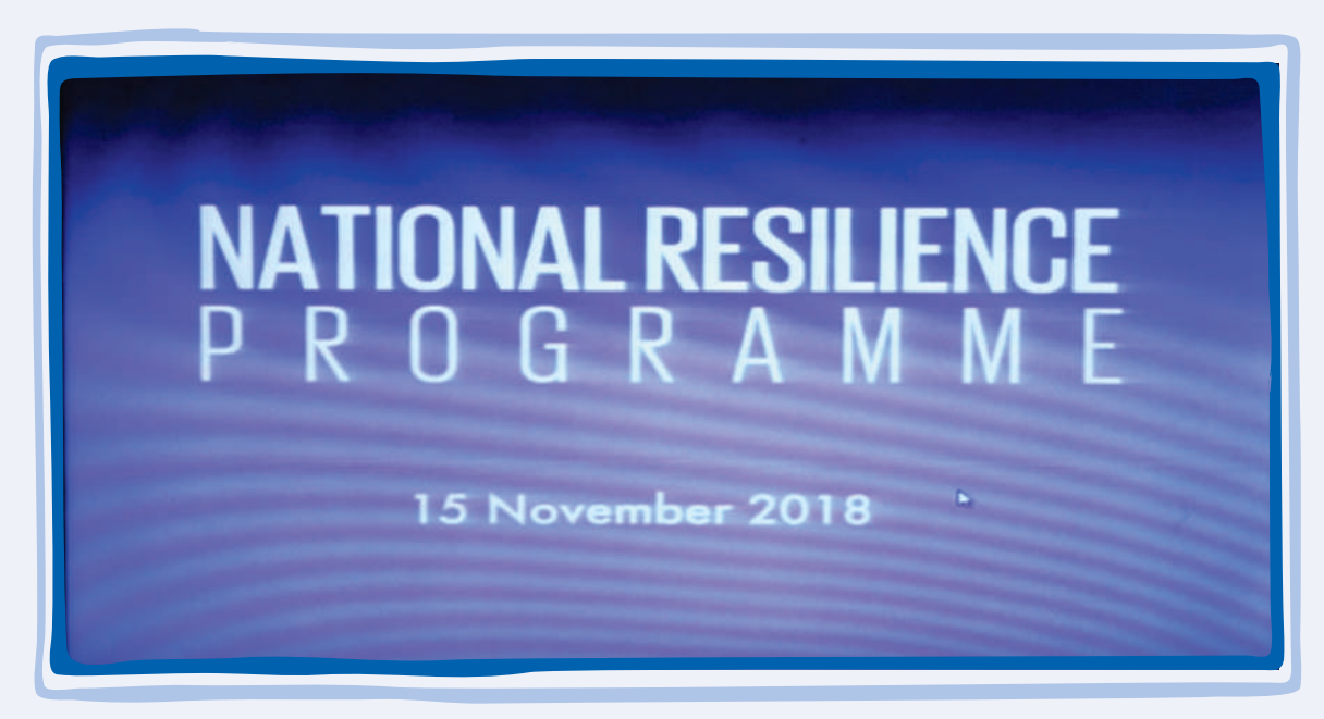
The NRP Launching Animation